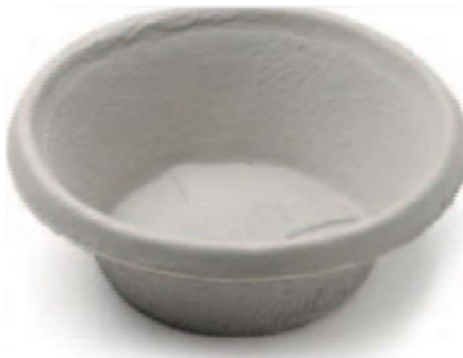
Tested to Comply with PAS29:1999